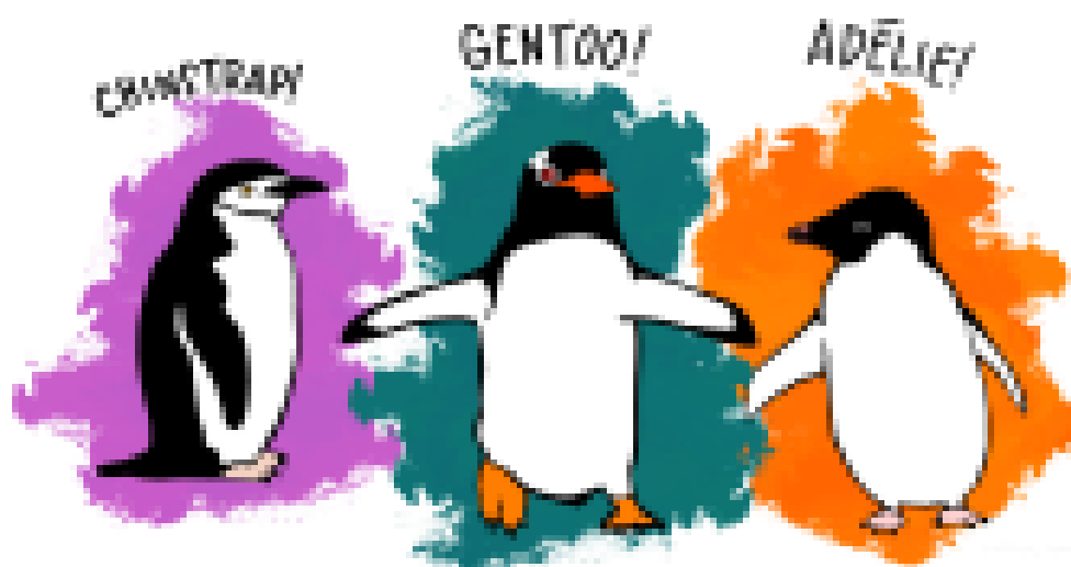
Figure 1: Artwork by allison_horst